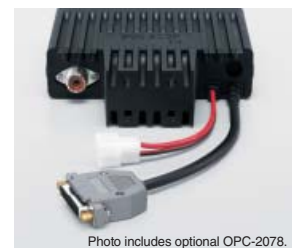
Photo includes optional OPC-2078.

The optional ACC cable allows you to connect with various external devices to control audio output, modulated signal input, remote channel control, horn honk and many more functions. OPC-1939 is a D-SUB 15-pin type and OPC-2078 is a D-SUB 25-pin type.